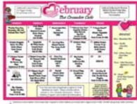
February Lunch Menu