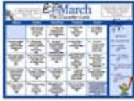
March Lunch Menu